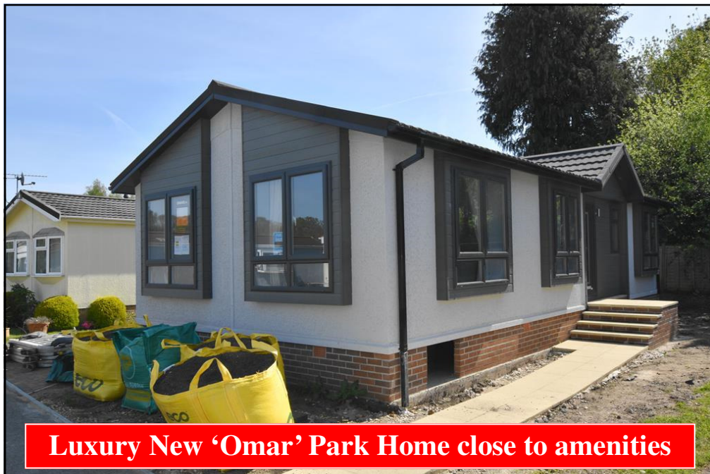
Luxury New 'Omar' Park Home close to amenities

9 Gladelands Park, Ringwood Road, Ferndown, Dorset. BH22 9BW